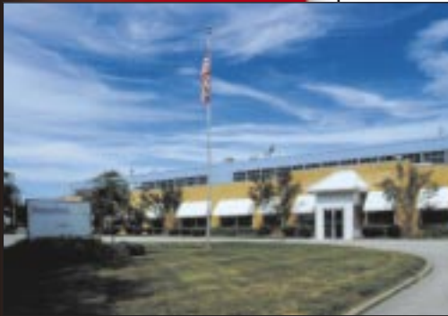
Metaullics Systems Co. L.P. 31935 Aurora Road Solon, Ohio 44139 Tel. 440.349.8800 Fax: 440.248.3432